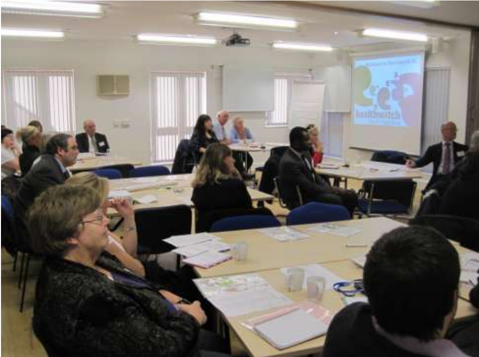
Healthwatch North Yorkshire launch in Selby