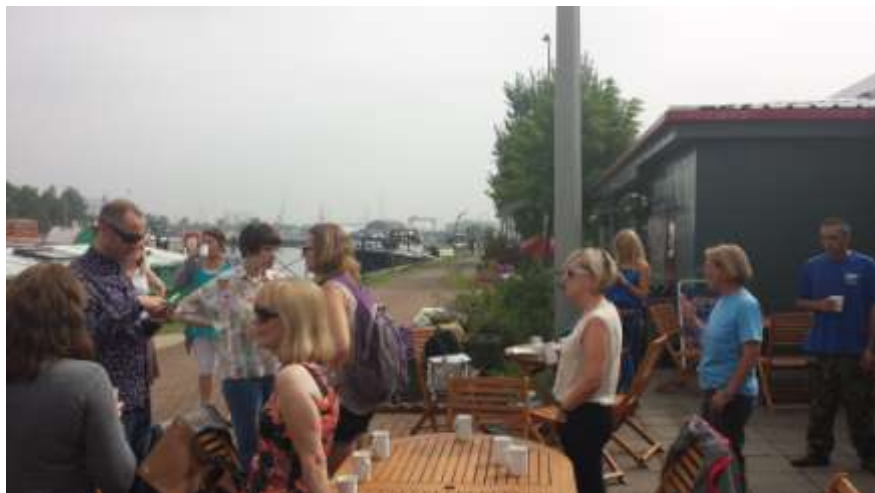
Waiting to board.....