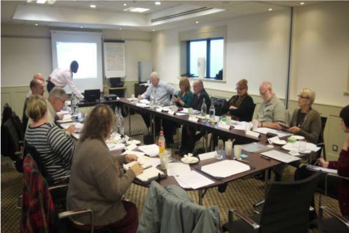
Healthwatch North Yorkshire Board development day