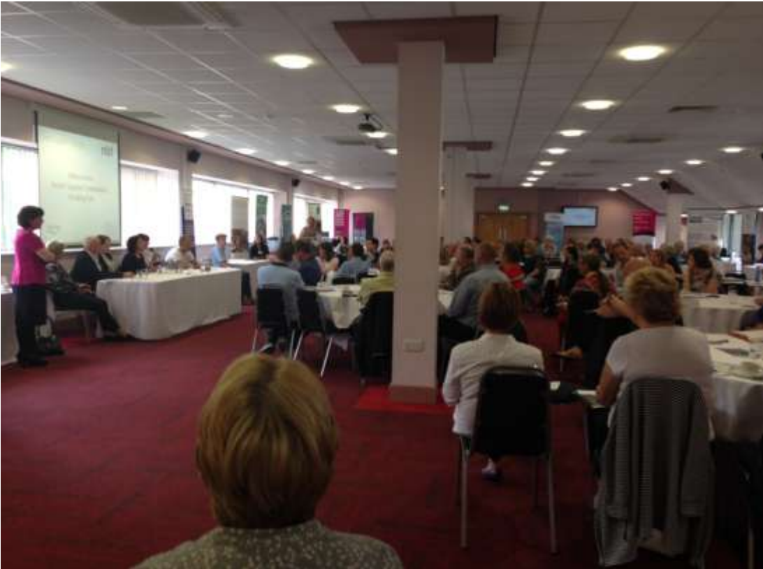
Calderdale Funding Fair