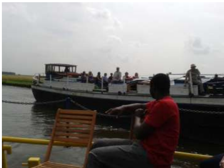
just passing by.....