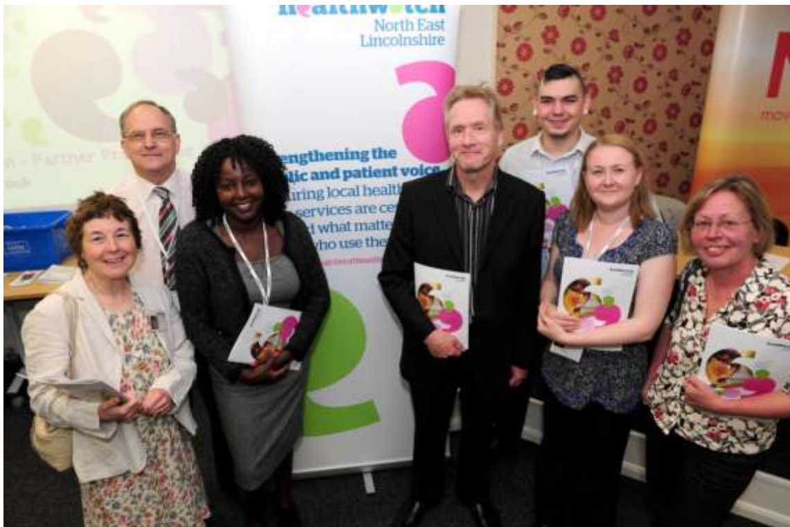
Healthwatch North East Lincolnshire Annual Report launch