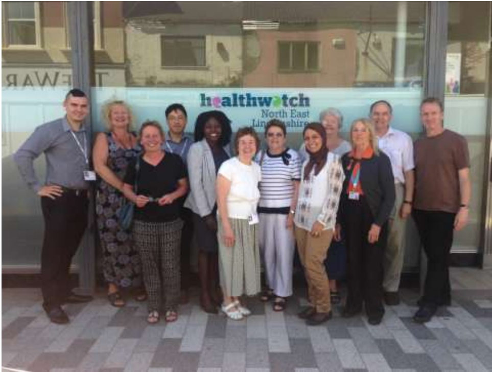
Healthwatch North East Lincolnshire staff and Board